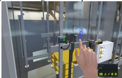
Fig.6 G Interactive Reality Scene

Roaming in the virtual teaching process can be achieved through automatic roaming and interactive roaming. Auto-roaming is an animation of the teaching process, which is mainly achieved through triggering and interpolation techniques. Static virtual environment can not meet the needs of teaching. Students can interact with humans in a virtual scene during virtual scene learning, which creates an interactive tour. Due to the limited interactive features available in 3D SMAX, students can use EON to describe motion to provide more interactive and animated features. While the user is roaming, when the mouse moves to a virtual object with a sensor, the virtual object will change with the operation of the input device, thereby generating an interaction.