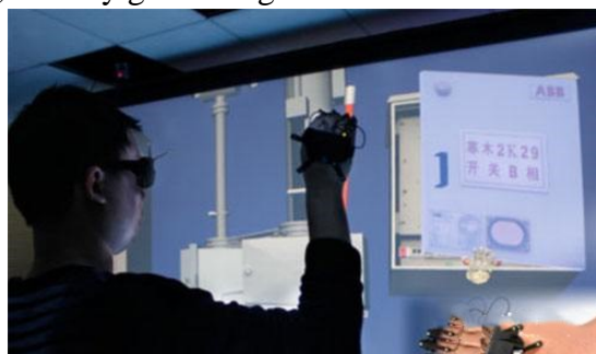
Figure.7 Roaming Interactive Virtual Scene