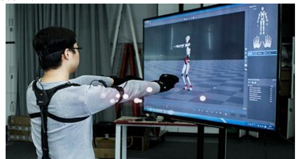
Figure.5 Instruction Capture