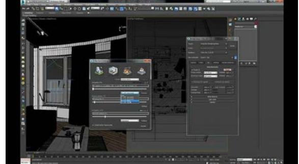
Figure.3 Material Selection

3D SMAX is a powerful visual modeling tool. In the process of constructing a virtual scene, it can fit the user demand model, and at the same time can set the implementation scene, scene material design, animation scene settings, path settings, calculate the length of the animation, create a camera and adjust the animation. Teachers make full use of modeling methods provided by 3D SMAX in the construction of teaching scenes, such as creating geometric objects directly, which can greatly simplify the complexity of VRML programming.